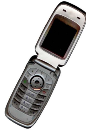
Fig. 2: Example of an image with acceptable resolution

Figures must be numbered using Arabic numerals. Figure captions must be in 8 pt Regular font. Captions of a single line (e.g. Figure 2) must be centered whereas multi-line captions must be justified (e.g. Figure 1). Captions with figure numbers must be placed after their associated figures, as shown in Figure 1.