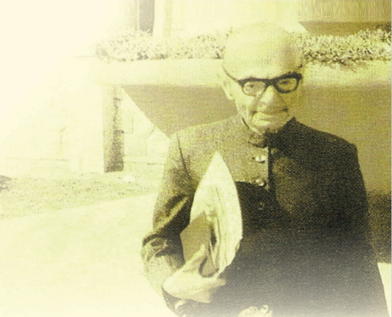
Founder of Jamia Hamdard : Late Hakeem Abdul Hameed

میں اکیلا ہی چلا تھا جانب منزل مگر لوگ ساتھ آتے گئے اور کارواں بنتا گیا