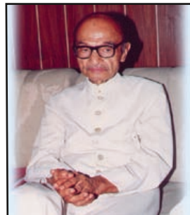
(14th Sept. 1908 - July 22, 1999)