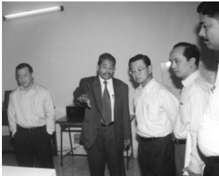
Delegation from Singapore.