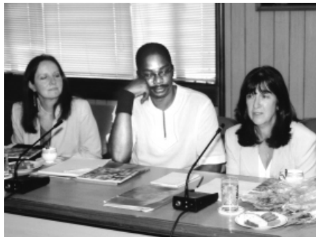
Delegation from Middlesex University.