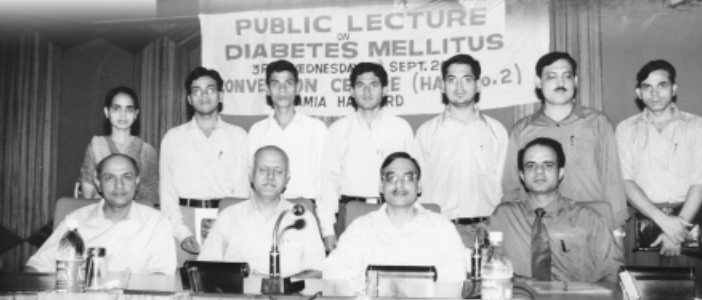
PUBLIC LECTURE ON DIABETES MELLITUS 3 RD WEDNESDAY, SEPT. 22 CONVENTION CENTRE (HALL No. 2) ALMA MATER