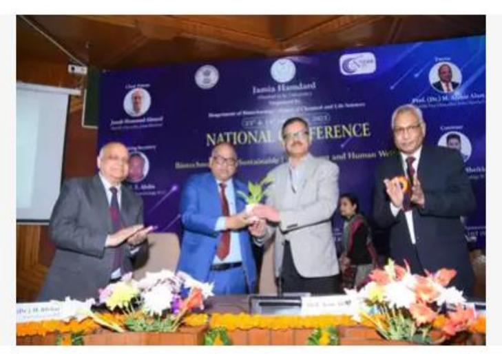
National Conference on Biotechnology for Sustainable Development and Human Welfare

Department of Biotechnology, Jamia Hamdard in collaboration with Department of Science & Technology and Department of Biotechnology, Government of India organized a two day